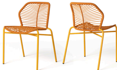
136-11/8 CHAIR - STACKABLE L 54 x P 56 x H 80