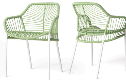
137-12/8 ARMCHAIR - STACKABLE L 59 x P 56 x H 80