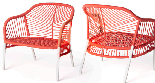
139-12/9 LOUNGE L 75 x P 77 x H 77