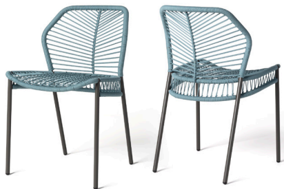
137-11/8 CHAIR - STACKABLE L 49 x P 56 x H 80