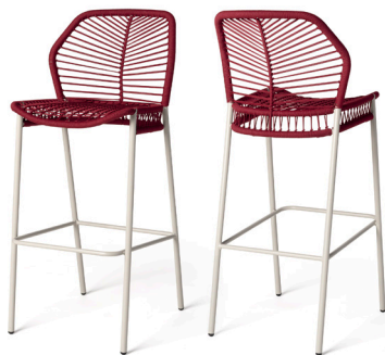
138-11/8 BARSTOOL L 49 x P 56 x H 108